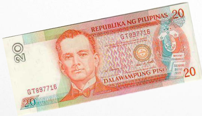
Twenty peso bill