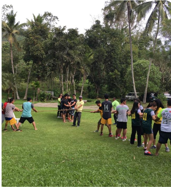
BODY (30%) 2017 January Team Building