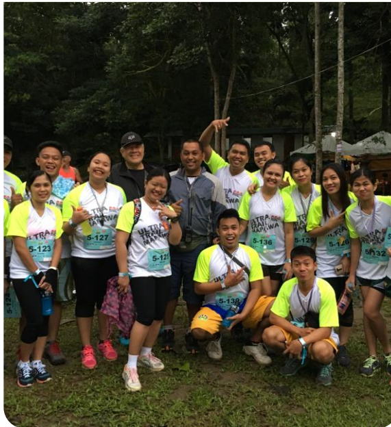
SUPER BODY (30%) October 28, 2017 Mapawa Ultra-Trail Run 15K Night Run